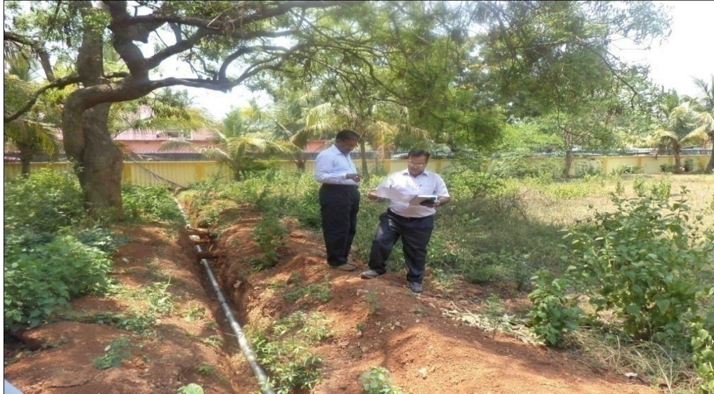
Site Visit and Discussions by WAPCOS Officials