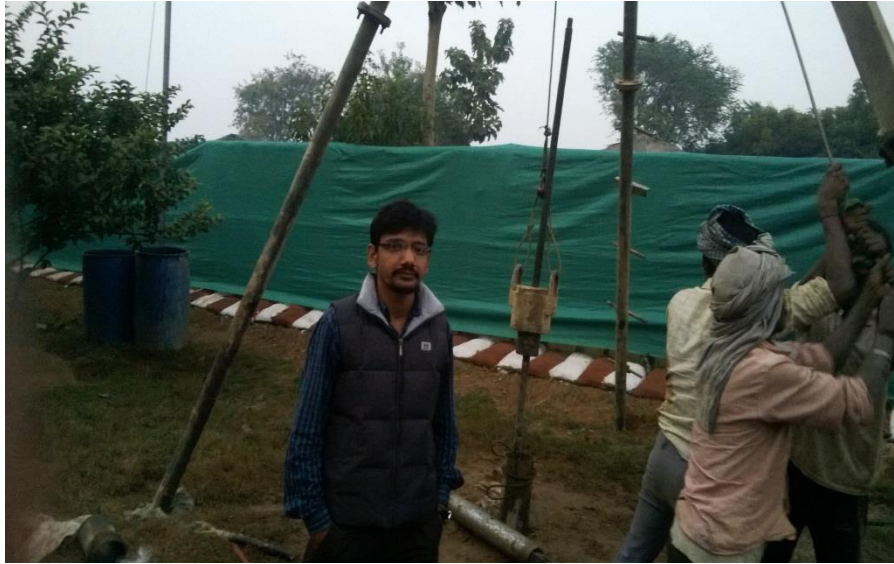
Site Visit and Geotechnical Investigation at Site