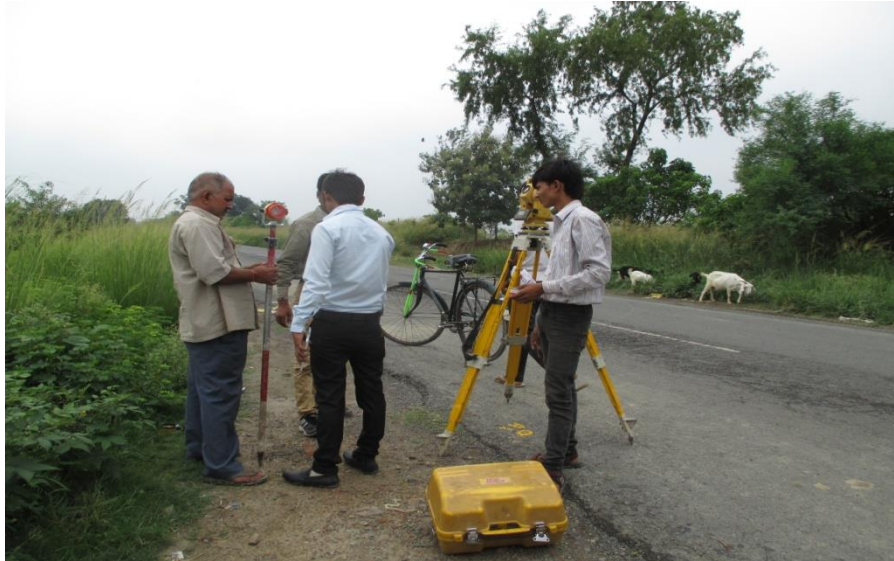
Topographical Survey at Site