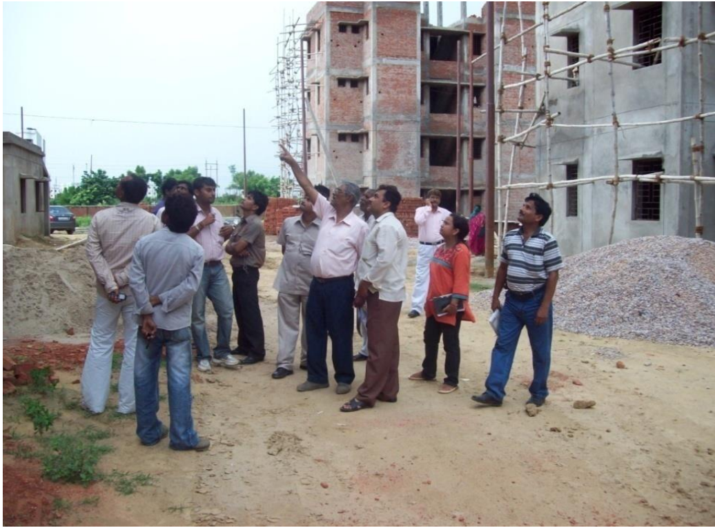
Site Visit and Discussions by WAPCOS Officials