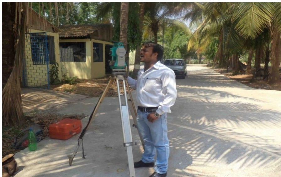
Topographical Survey at Site