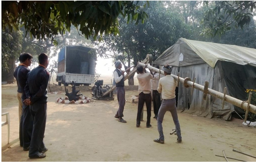
Site Visit and Geotechnical investigation at Site