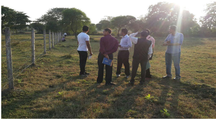
Site Visit by WAPCOS Officials