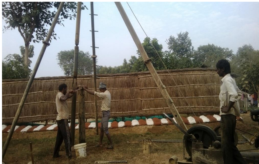
Site Visit and Geotechnical Investigation at Site