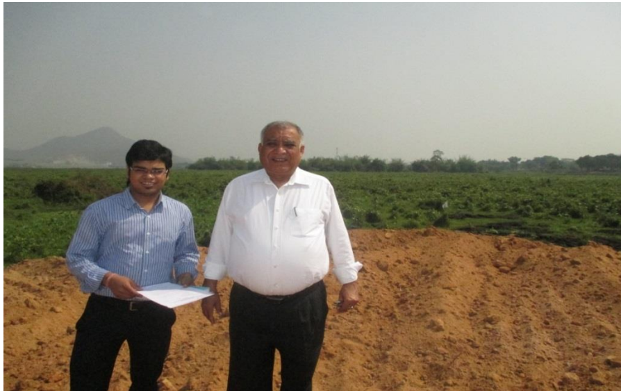
Site Visit by WAPCOS Officials