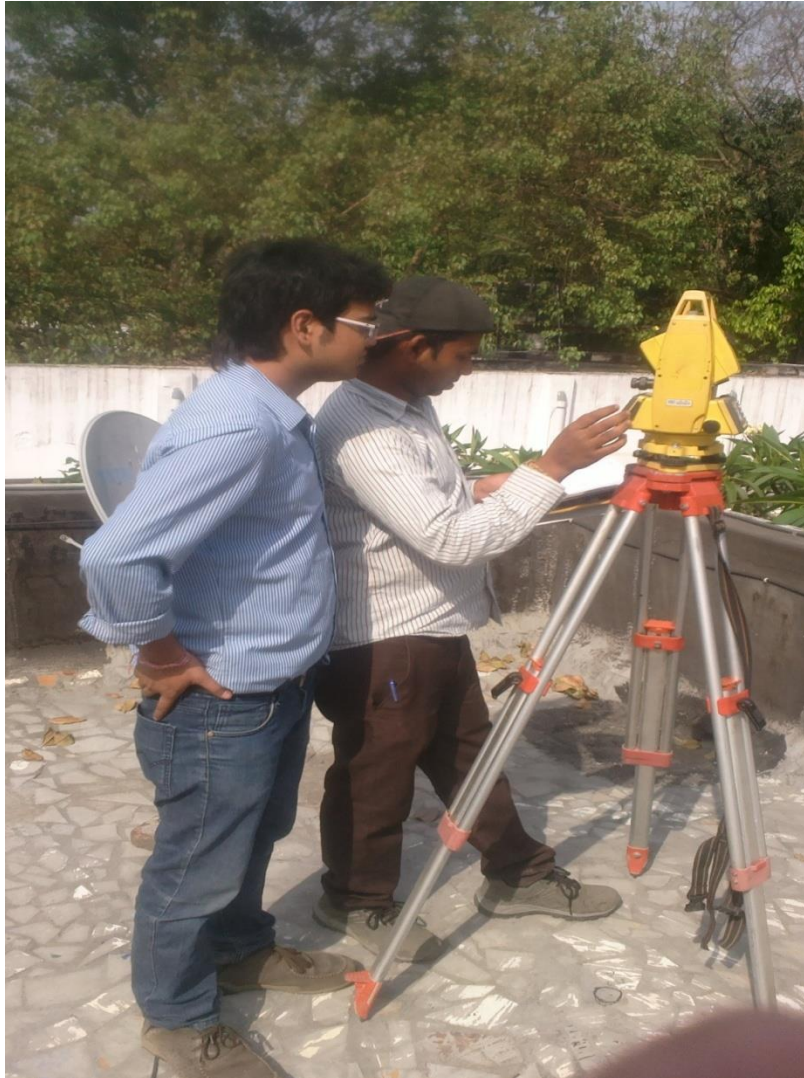
Topographical Survey at Site