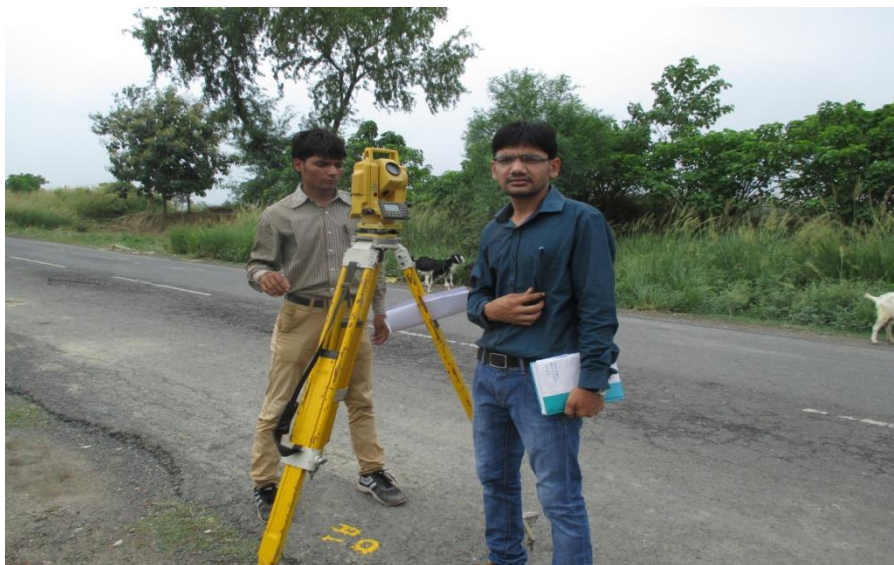
Topographical Survey at Site