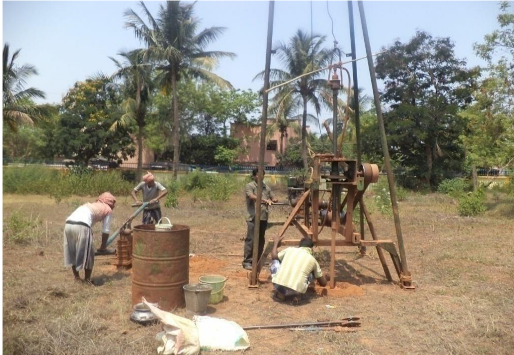
Geotechnical Investigation at Project Site