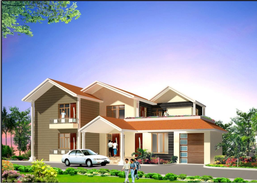
Tentative 3D View