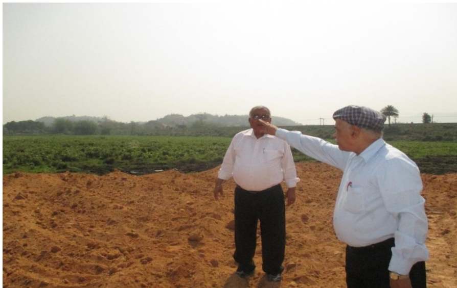
Site Visit by WAPCOS Officials