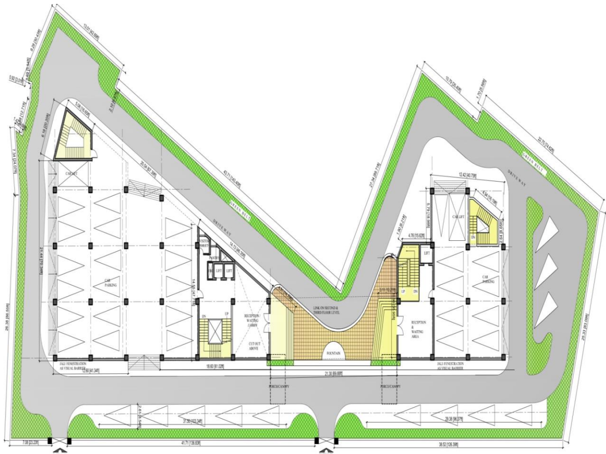
Tentative Layout Plan