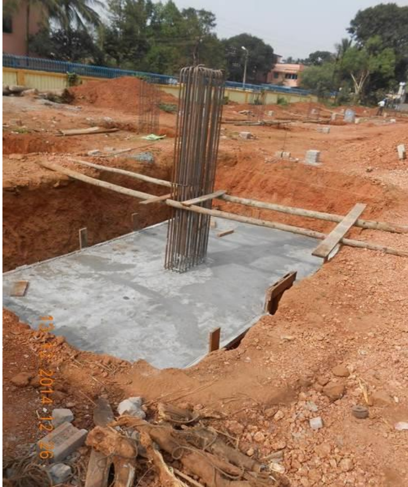
Construction of Column at Site