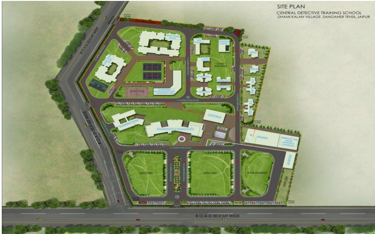
Tentative Layout Plan