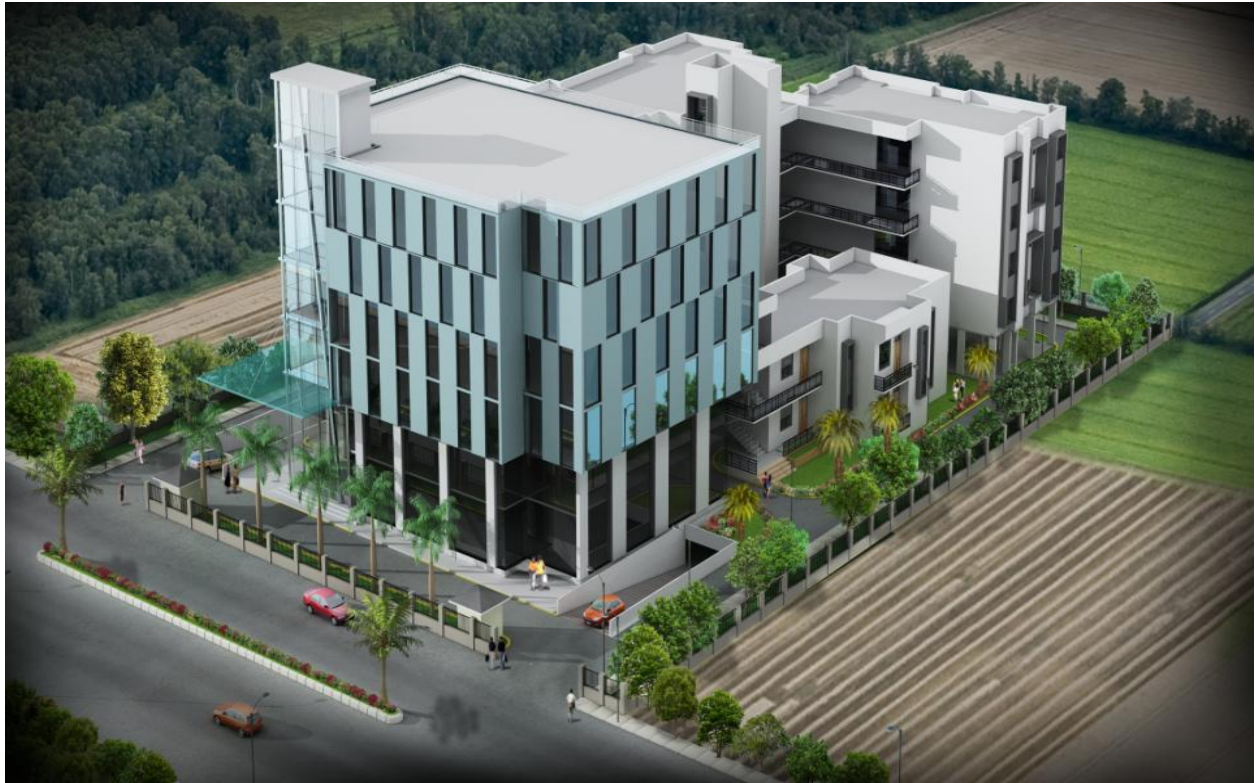
Tentative 3D View