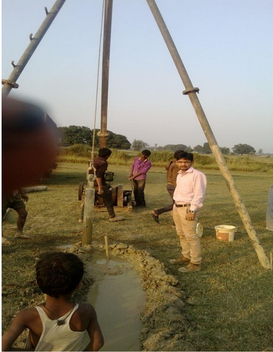
Geotechnical investigation at Site