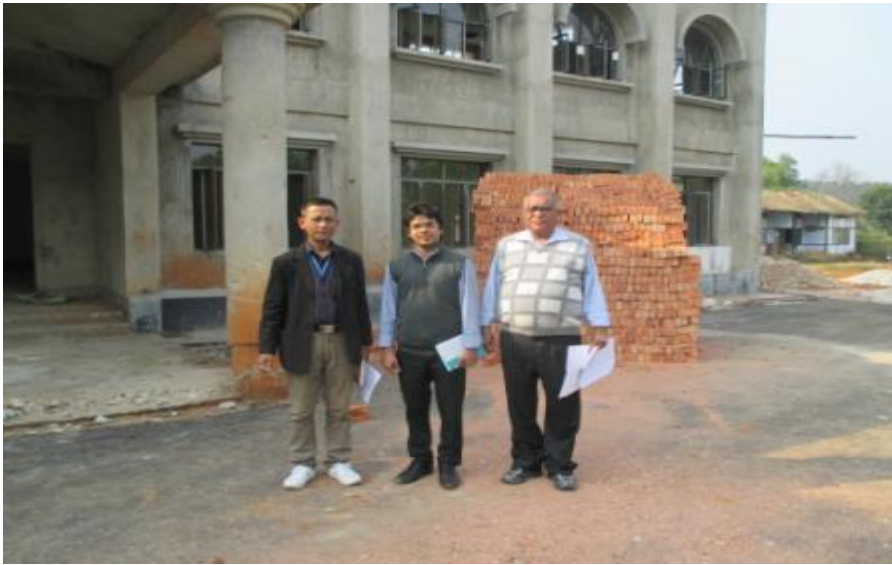
Site Visit by WAPCOS Officials