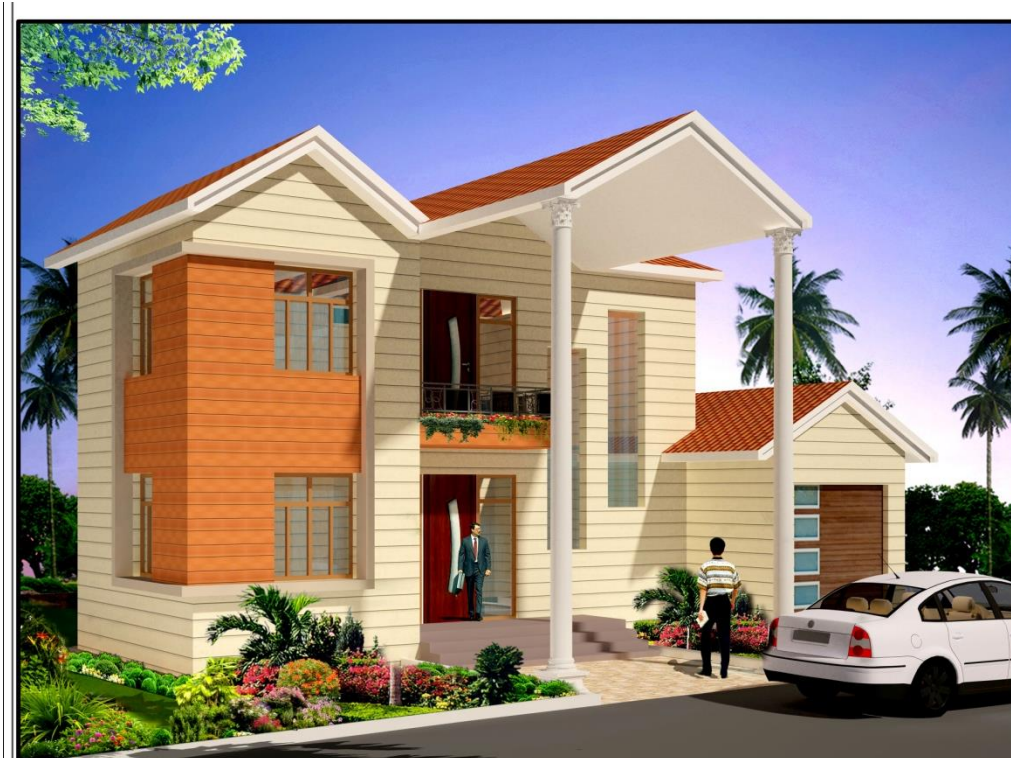
Tentative 3D View