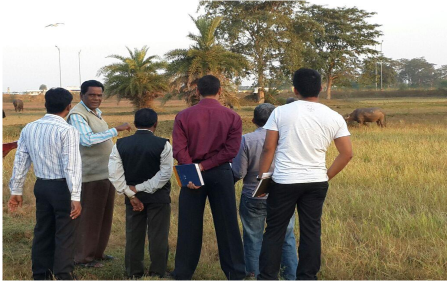
Site Visit by WAPCOS Officials