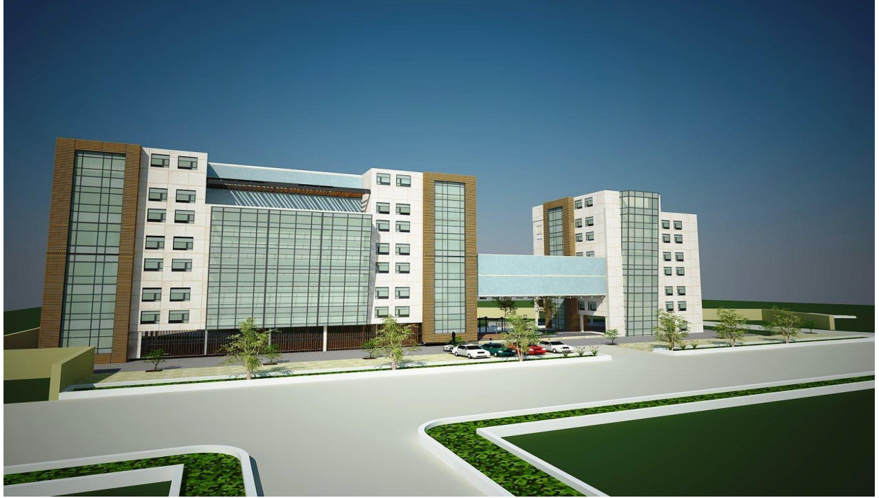
Tentative 3D View